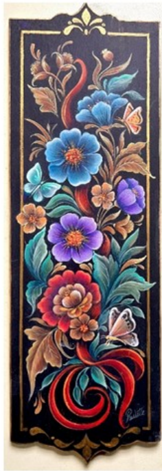
Ribbon Floral: Saturday, June 27

Two Options: On-Site at the Livonia Senior Wellness Center or on ZOOM