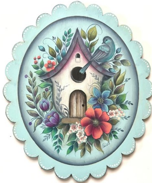
New Pattern Birdhouse: Sunday, June 28

Time: 9:00 am – 4:00 pm (EST) On-Site: Livonia Senior Wellness Center 15100 Hubbard Livonia, MI 48154