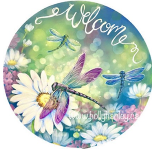
Dragonflies: Sunday, May 24

Time: 9:00 am – 4:00 pm (EST) On-Site: Livonia Senior Wellness Center 15100 Hubbard Livonia, MI 48154