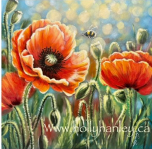
Poppies: Saturday, May 23