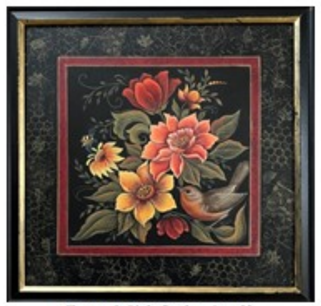
Flowers & Bird: Sunday, June 22 Surface: 12° square, wood or MDF in a 12° reachingade, frame from Michaels

Time: 9:00 am - 4:00 pm (EST) On-Site: Livonia Senior Center 15218 Farmington Rd. Livonia, MI 48154 ZOOM is an option