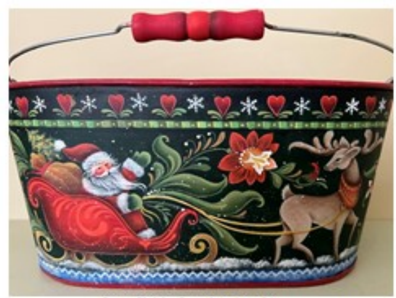
Santa Sleigh: Saturday, June 21 Surface: Oval metal bucket from Hobby Lobby SKU 1607712 Painted area is 14° long x 5-1/4° high; allow extra room all around