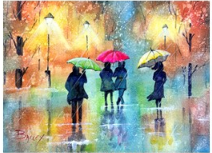
Saturday, May 17: Rainy Nights

Time: 9:00 am - 4:00 pm (EST) On-Site: Livonia Senior Center 15218 Farmington Rd. Livonia, MI 48154