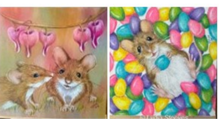
For Chipper Lovers: Saturday, Sept 20