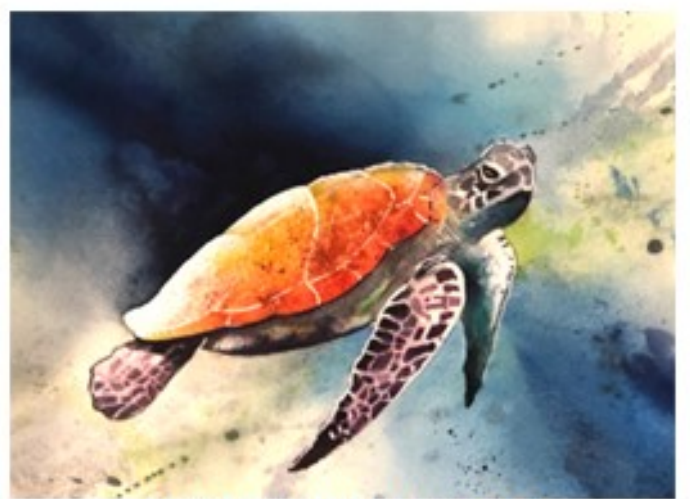
Sunday, May 18: Under the Sea

Time: 9:00 am - 4:00 pm (EST) On-Site: Livonia Senior Center 15218 Farmington Rd. Livonia, MI 48154