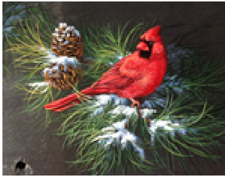
A Cardinal Christmas