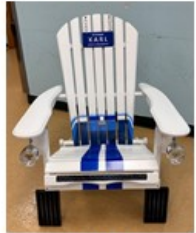
The Race Car