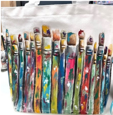
Paint Brush Bag