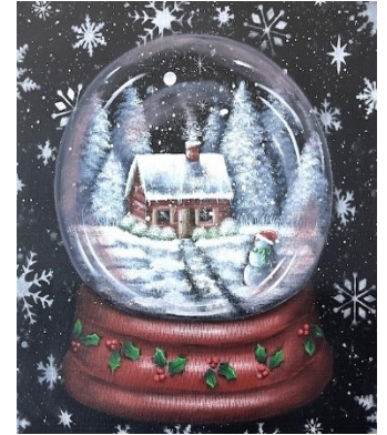
Snowy Winter Magic