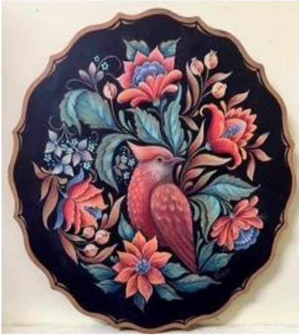
Coral Bird & Blooms: Saturday, Sept 7 12" scalloped flat plate #SCF-PL