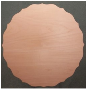
Coral Bird: 12" scalloped flat plate #SCF-PL

You can also choose to use a surface of your choice.