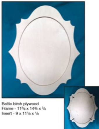
Baltic birch plywood Frame - 11 3/8" x 14 3/4" x 3/8" Insert - 9" x 11 1/8" x 1/8"