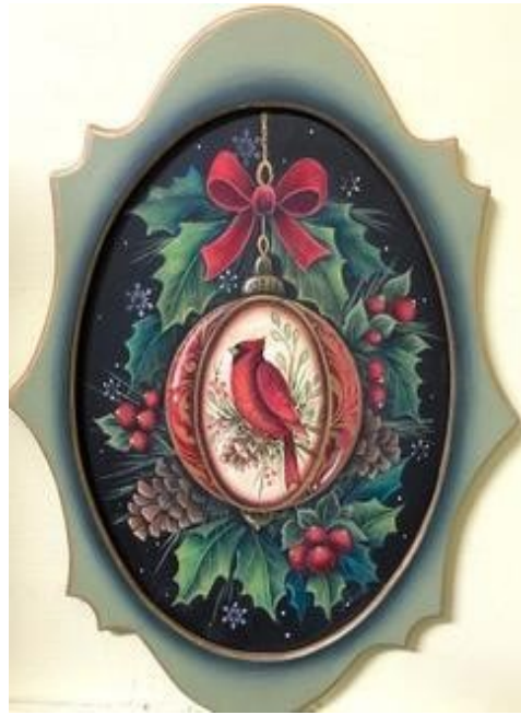
Cardinal & Holly: Sunday, Sept 8 Oval plaque with insert (2 pieces) #OVL-PLKS Extra inserts #OVL-PLIN

Time: 9:00 am – 4:00 pm Where: Livonia Senior Center 15218 Farmington Rd. Livonia, MI 48154