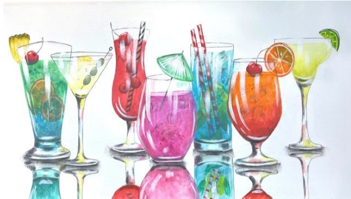
Delightful Summer Drinks