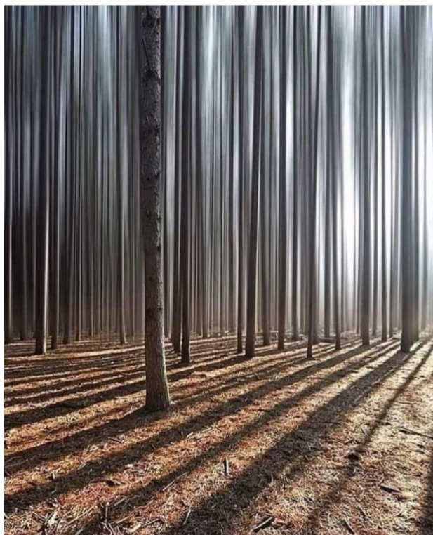
Nature's barcode...

Oct 12: Sally Thirjung, On-site 9am—noon